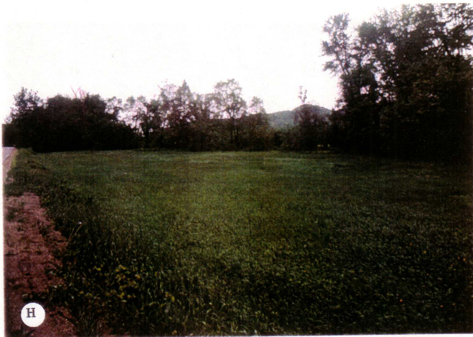
Date Taken: June 1, 1992 Identification: View across easterly portion of property