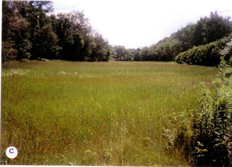
Date Taken: July, 1998 Identification: West meadow looking west