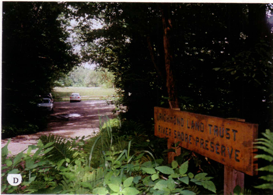
Date taken: July, 1998 Identification: Preserve parking lot, looking west