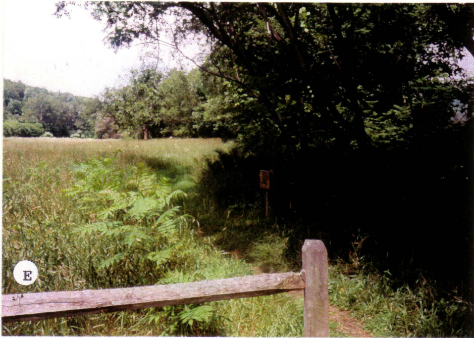
Date Taken: July, 1998 By: Warren Beeken Identification: Rivershore Trail, looking west from parking lot