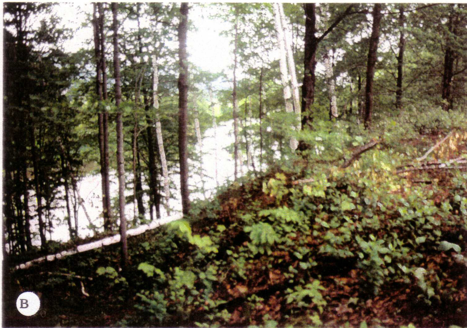
Date Taken: June 1, 1992 Identification: Banked area in easterly portion of property