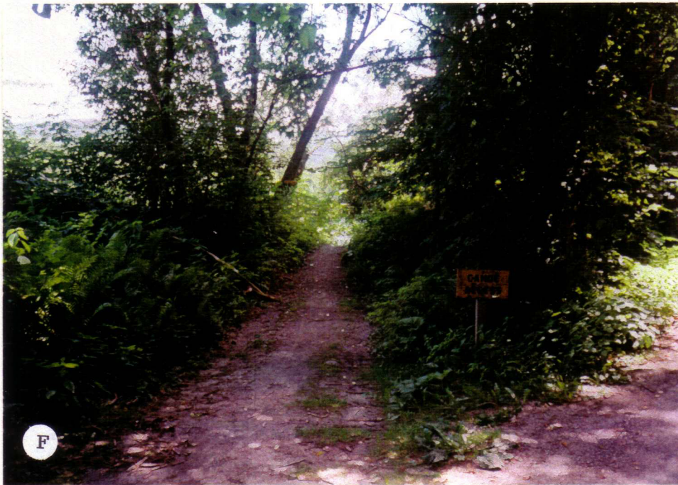
Date Taken: July, 1998 By: Warren Beeken Identification: Canoe access trail to Winooski river from parking lot