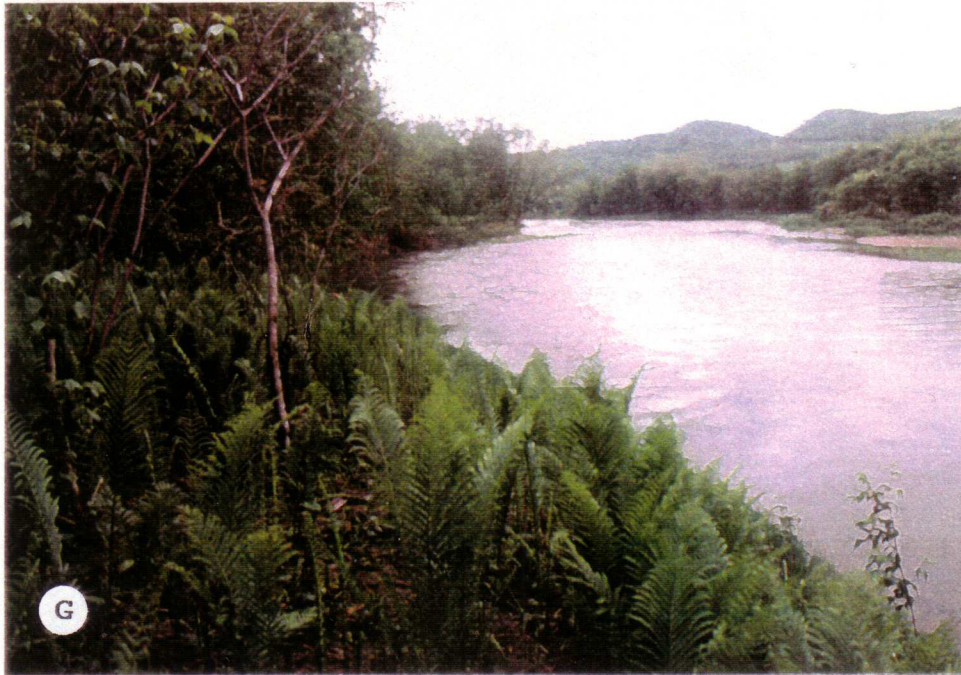
Date Taken: June 1, 1992 Identification: River frontage