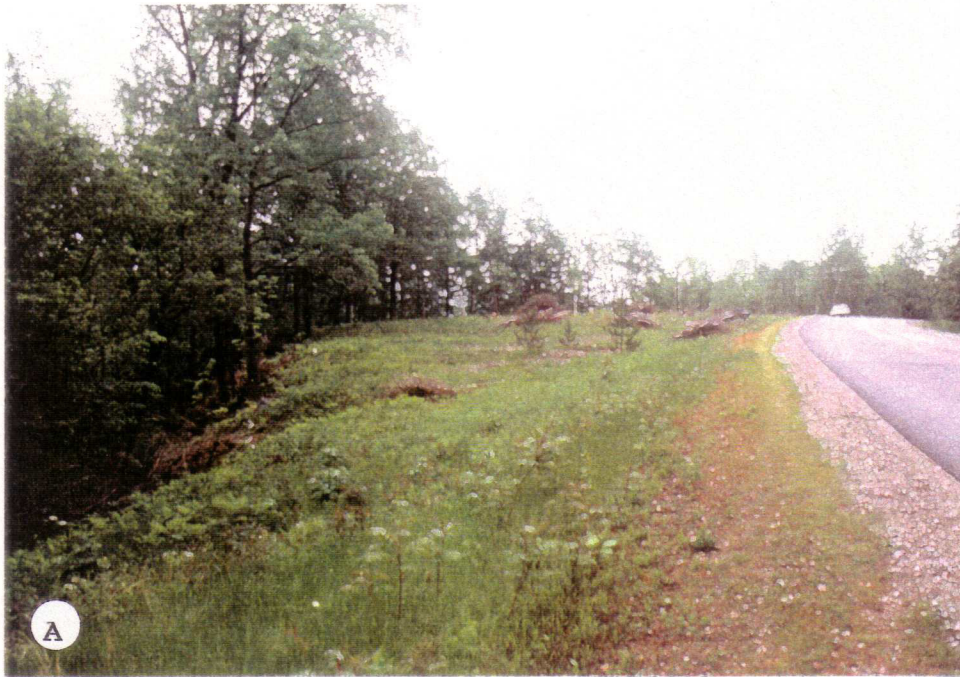
Date Taken: June 1, 1992 By: Kurt J. Kaffenberger Identification: View easterly along road frontage from southwesterly corner of property